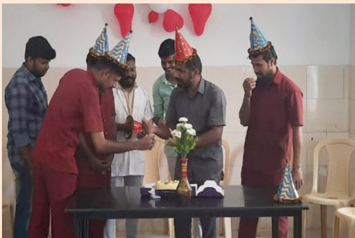
Birthday celebrations of employees of Pollachi Unit