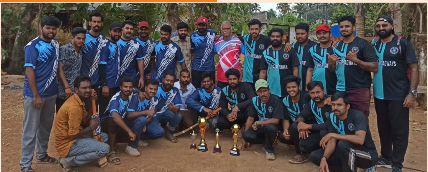
O n March 19th, a cricket tournament was organized for employees of Vaidyaratnam Group at C.N.N School Ground Cherpu. Nine teams from different departments played against each other. Pollachi Unit & FG Godown team competed against each other in the finals and Pollachi Unit team was declared as the Champions of the tournament.