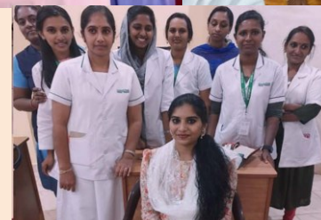
Women's day celebrations at Vaidyaratnam